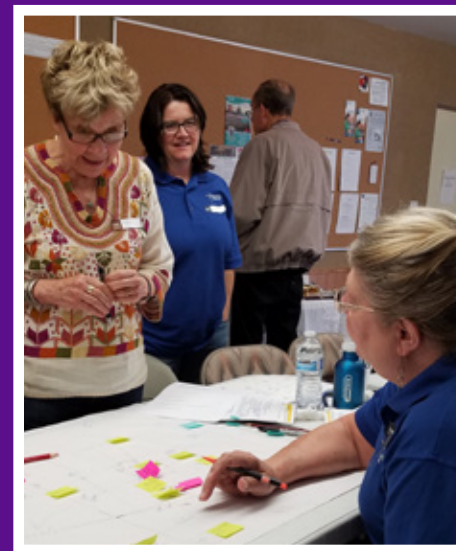
Congragations working the process

In November, CLH begins a collaboration with Living the Resurrection, a vitality initiative to help Southern California pan-Lutheran congregations thrive through processes, workshops, keynotes, consultations, and coaching.